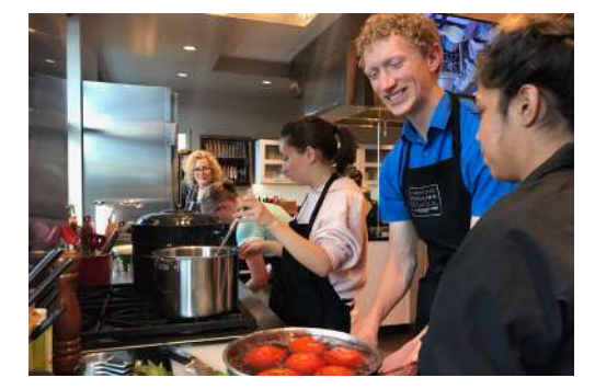
Solutions Scholars learn how to can food at the Harmons Cooking School.

experience; 2) an introductory course exploring 21st-century social challenges from an interdisciplinary perspective; 3) research experiences on a specific social challenge with close mentoring by faculty; 4) formal research presentations/publications; 5) an internship experience in one of over 100 internship placement sites; 6) and a $1,000 scholarship per semester for four semesters. The scholarship allows students to focus their efforts on their university experience, important here at the University of Utah where so many students must work to support their educations. o