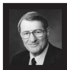
Neal A. Maxwell