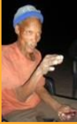
A !Kung Bushman, sporting a Calvin Klein hat, tells stories at a firelight gathering in Africa's Kalahari Desert.

“What alternatives do men have when there aren't enough women?”